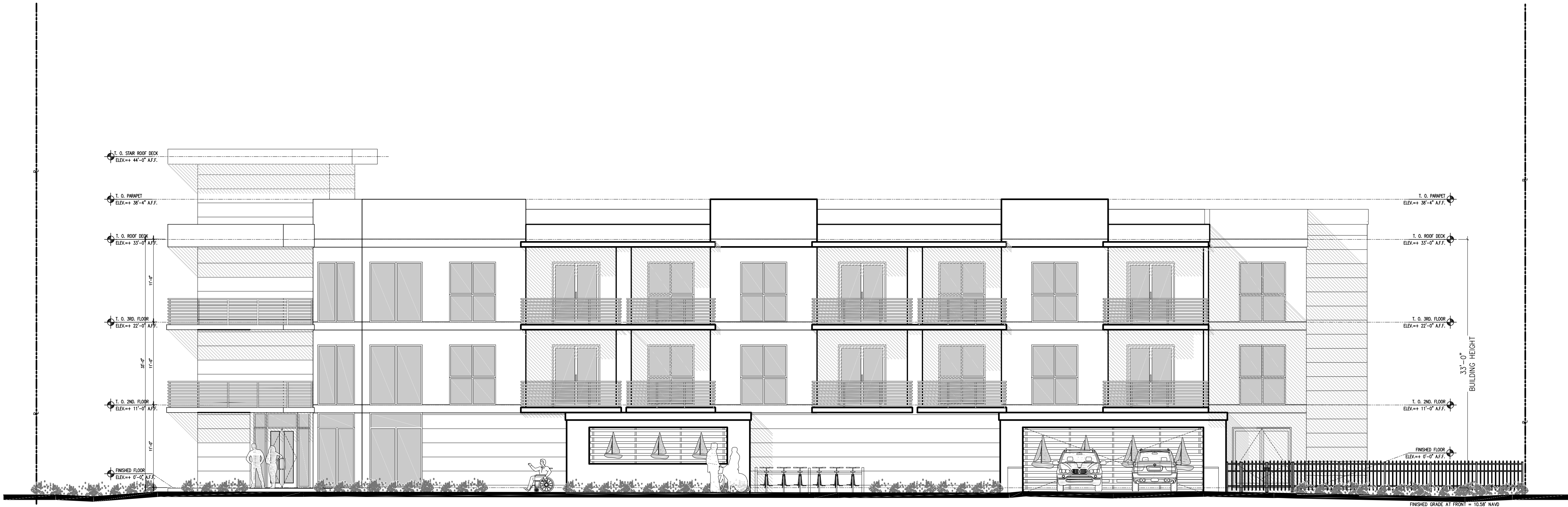
2 NORTH ELEVATION SCALE: 1/8" = 1'-0"